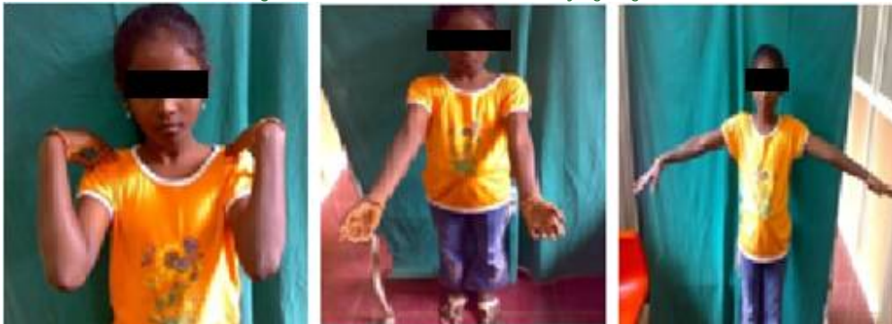
Figure A: pre op