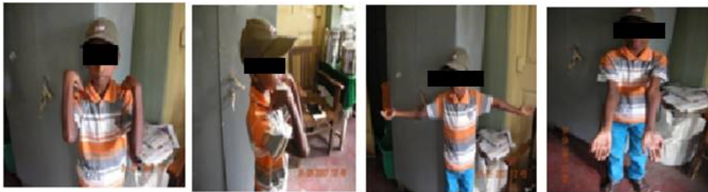
Figure: Flexion Extension Normal Carrying Angle